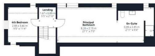
Main House - First Floor