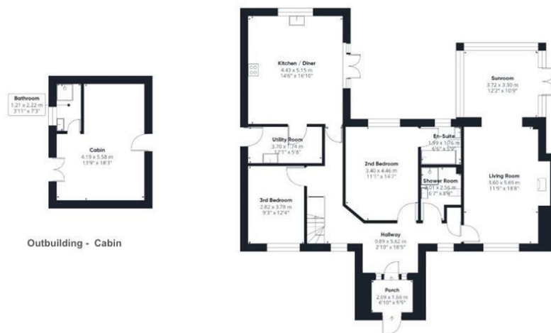
Main House - Ground Floor